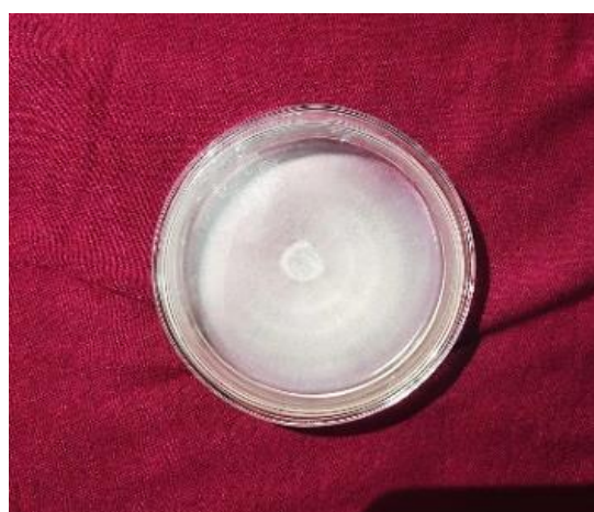
Plate 3. Pure culture of Phytophthora sp.