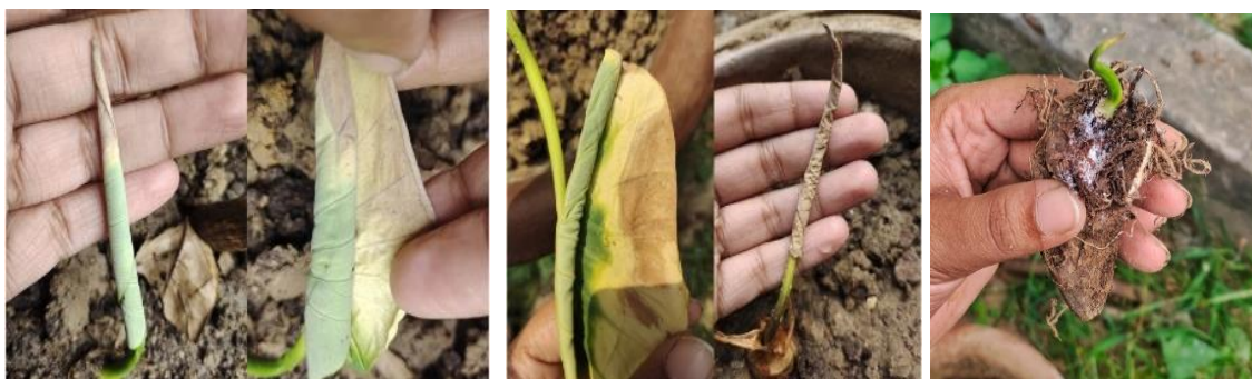
Plate 4. Phytophthora blight and corm rot symptoms of Colocasia (after corm germination)