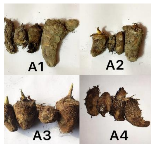
Plate 1. Collected colocasia corms from different markets in Andhra Pradesh

Sixteen infected corm samples of Colocasia are shown in Plate 1. were collected from different markets in two districts (West Godavari and East Godavari) of Andhra Pradesh (Table 1) and pot experiment was carried out (October- March) in the Department of Plant Pathology, SHUATS, Prayagraj during Rabi season (2022-23).